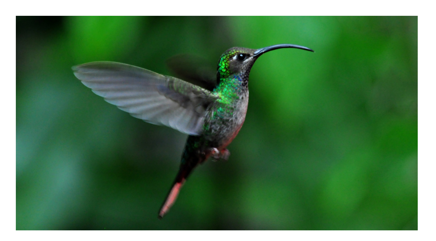
8D/7N from 1229$ per person